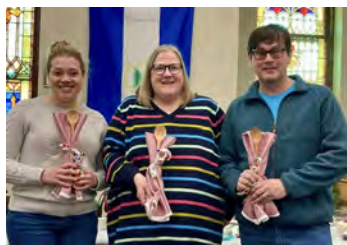
Last Year's Chili Winners!

Everyone is welcome to join us for chili tasting and judging! (no qualifications necessary) We appreciate any hands that can help with the set up and the clean up as well. Sign up to bring a Chili to enter or to bring toppings &/or sides in the back of the sanctuary!