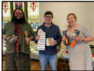
Last Year's Chili Winners!

Everyone is welcome to join us for chili tasting and judging! (no qualifications necessary) We appreciate any hands that can help with the set up and the clean up as well. Sign up to bring a Chili to enter or to bring toppings &/or sides in the back of the sanctuary!