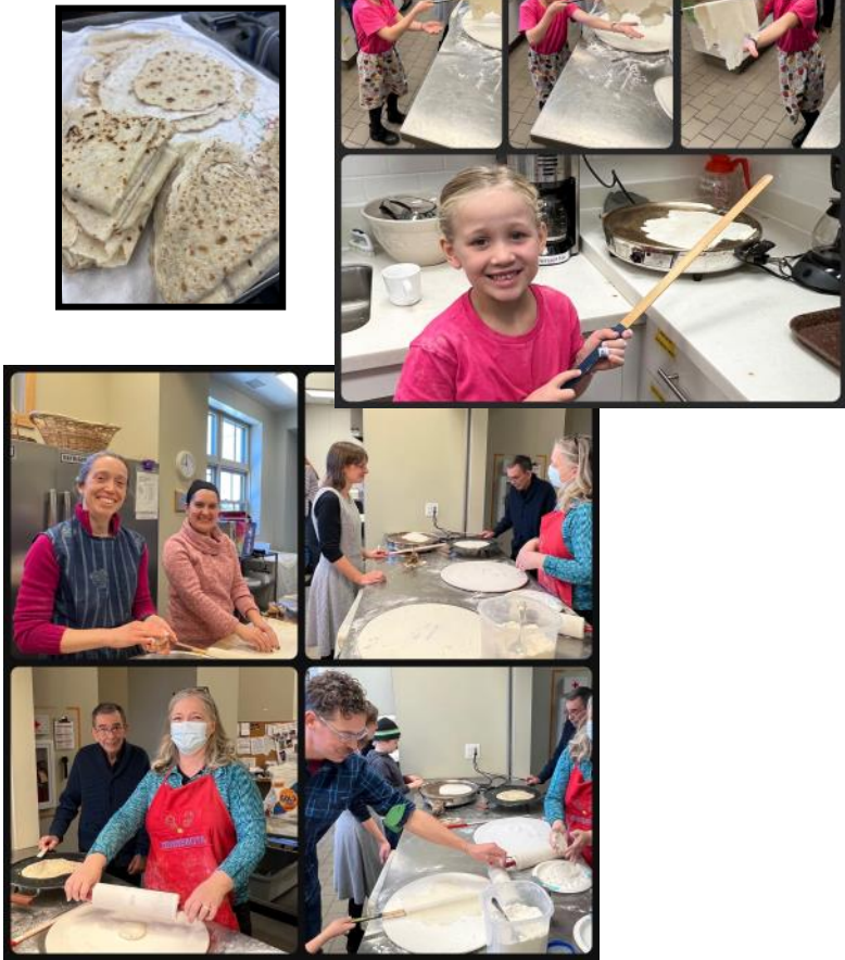
Lefse Making in December