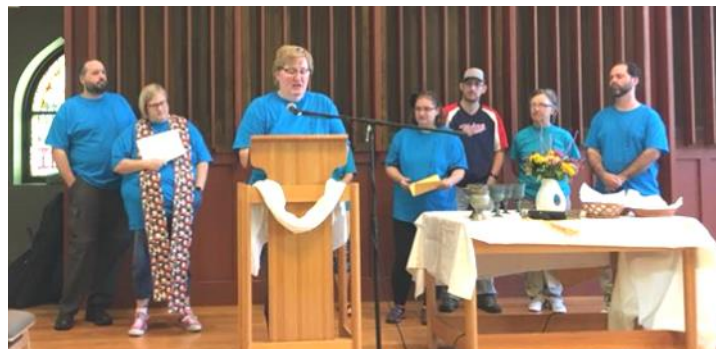
On Gathering Sunday, participants in the Detroit Mission Trip shared their experiences at worship.