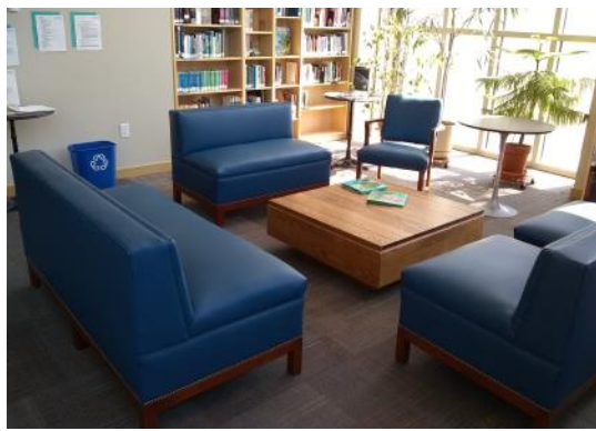
Come check out the newly refurbished furniture in the sun room!!

Springhouse Building Committee is looking for volunteers for a Share the Care event on Saturday, June 16 from 8-10 AM and then again from 12-2 PM. We're cleaning both the upstairs and downstairs carpets to get out the winter grime and need folks to move furniture out of the way and then back into position after the cleaning. Many hands make light work, so let's all show up, finish quickly, and use the extra time to party!