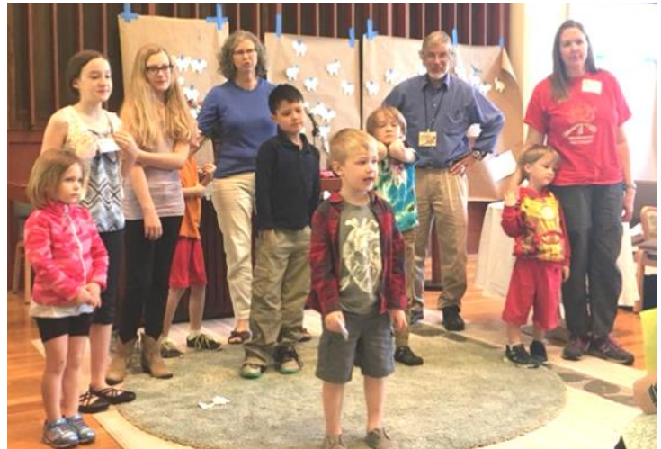
SpringHouse gathered for a joint worship service to celebrate the end of the Sunday School year. The children led everyone in worship that showcased their Godly Play curriculum.

Set aside time during the week of July 16-19 to be part of FCC's Mission on our Doorstep! Every year they invite Salem to be part of this amazing tradition of being Christ in the world...this year, let's participate! This is a great opportunity to build relationships with our SpringHouse friends and do some good work for our neighbors. See details on page 5.