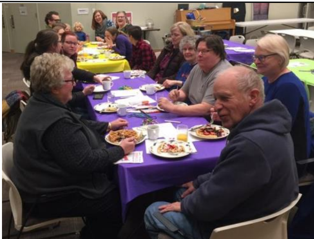
Salem and SpringHouse members enjoy a Fat Tuesday waffle feast!

We have a lot of work to do and we need as many of you as we can get to help us dream of the different ways we can do it!