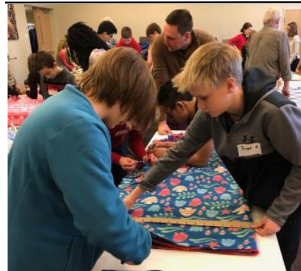
Salem kids participate in a service project with other Reformation Confirmation kids in February