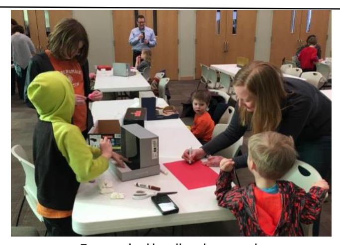
Fun was had by all at the annual Palm Sunday Peeps Diorama event!

In order to make these opportunities possible for EVERY ONE who would like to attend, we are asking anyone who is willing and able to make a financial contribution to go toward scholarships to help cover the costs for our youth.